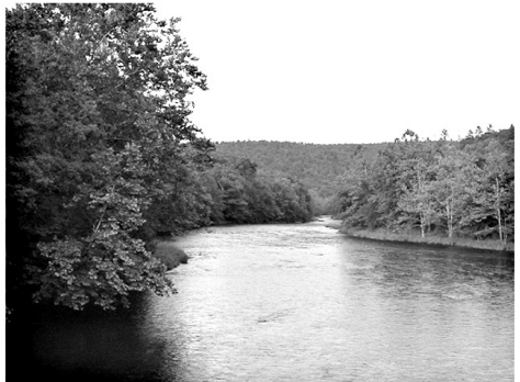
The Lackawaxen River

Streams are dynamic systems, constantly changing and interacting with the landscape. The way streams look and behave depends on the geology and climate of a region. Headwater streams , which occur at the highest elevations of a watershed, tend to comprise the majority of stream miles in a watershed. Streams can also be defined by their flow characteristics. Perennial streams have year-round flow. Intermittent streams have seasonal flow which may disappear during drier periods of the year. Flow in an ephemeral stream generally occurs only during or immediately after rainfall events. All of these streams, regardless of whether they have year-round flow, are important to maintaining